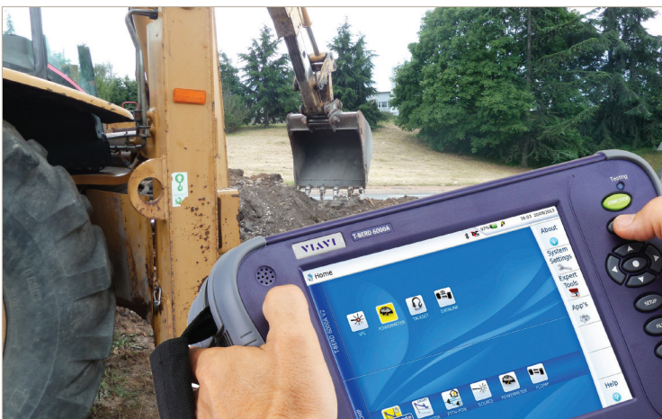
Portable and upgradeable platform with interchangeable test modules increases technician productivity

The flexibility of interchangeable module carriers and various plug-in modules let users create a platform that meets today's specific testing needs and yet it can evolve seamlessly to meet tomorrow's ever-changing network requirements.