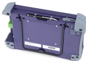
E6100 Fiber module carrier