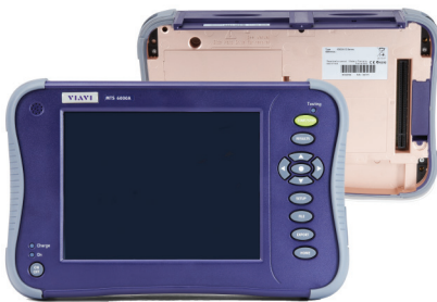
Back of the module carrier where other modules are attached

The multidimensional design of the T-BERD/MTS-6000A (V2) provides optimal configuration flexibility with extended battery life. The E6100 module carrier is best suited for fiber applications; whereas, the high-powered battery in the E6200 module carrier extends battery life when used with the carrier Ethernet (MSAM) or other intensive fiber applications.