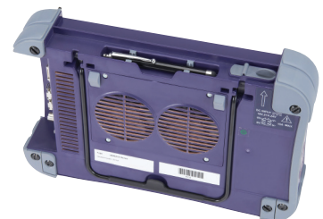
E6200 MSAM and Fiber module carrier