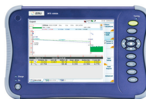
Compact multilayer platform for network installation and maintenance