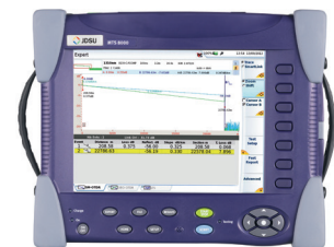
Scalable platform for multiple-layer and multiple-protocol testing