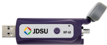
Miniature USB 2.0 Power Meter