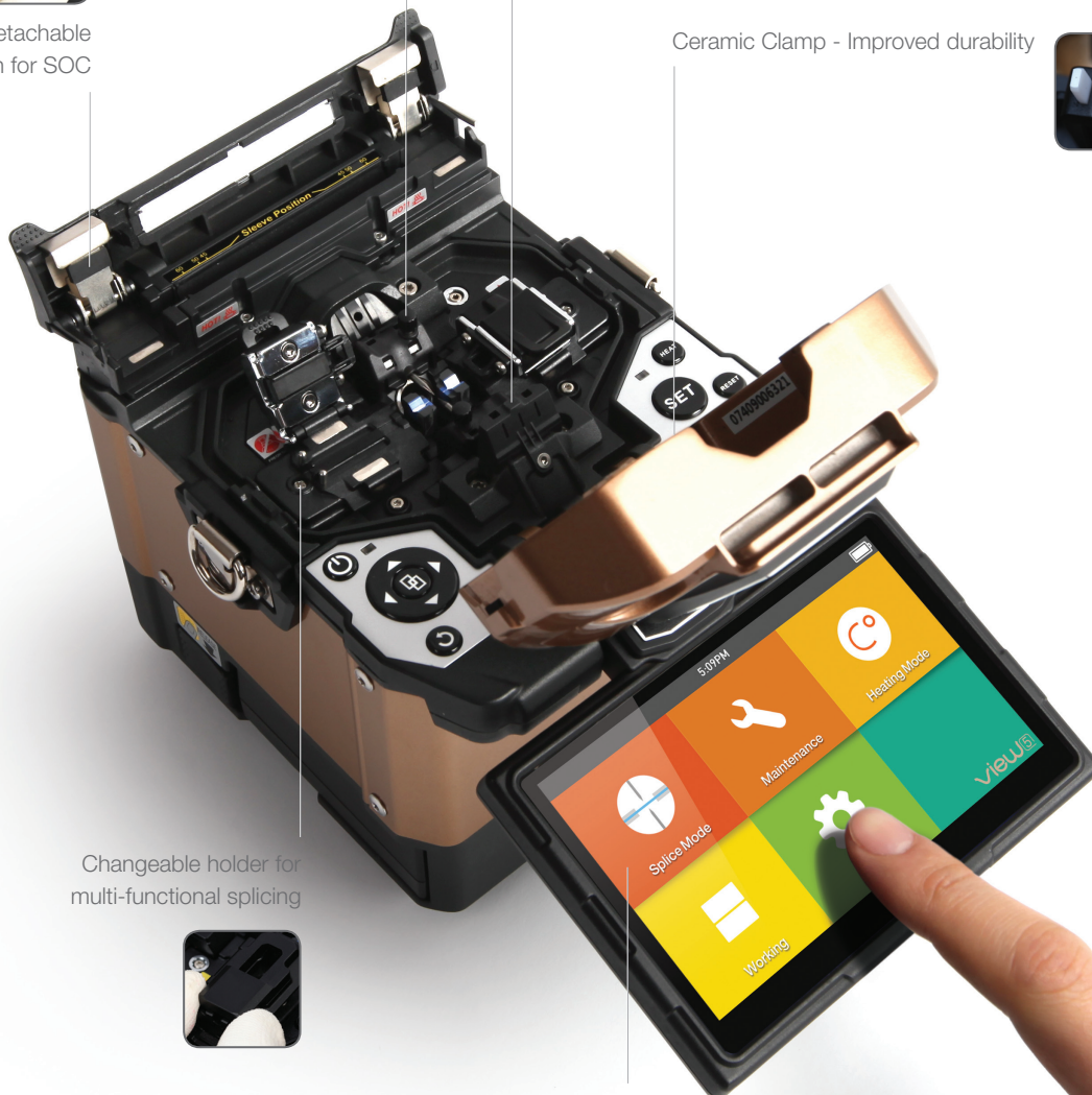
Changeable holder for multi-functional splicing